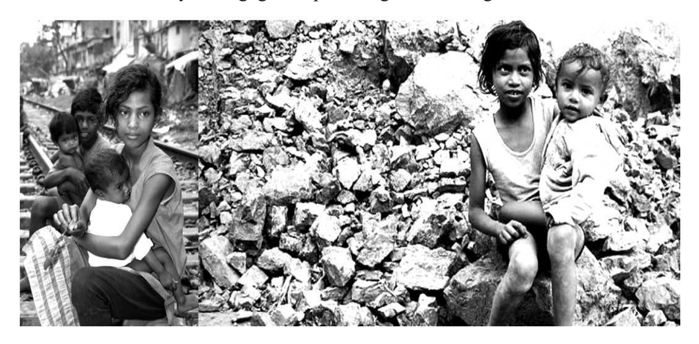
Fig 1 Parenting their siblings

• Some children are wondering here and there and try to earn so that can support to their parents financially. This picture we can see morein rural area where there are less sources of income.