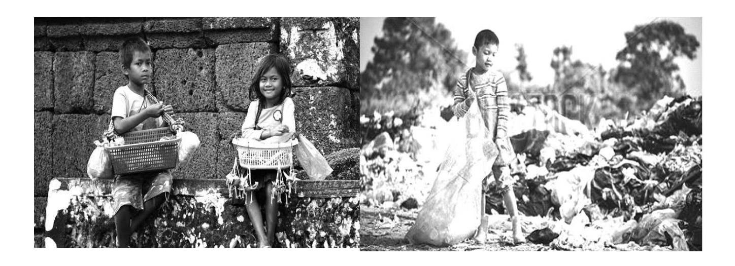
Fig 2:—Earn something to support family Fig 3